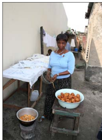
Women in Kinshasa make and sell pastries similar to donut holes, as an income-generating project.

The 10-minute program (PDS #25384-08-001) illustrates how IHM carries on PC(USA)'s century-long tradition of health missions.