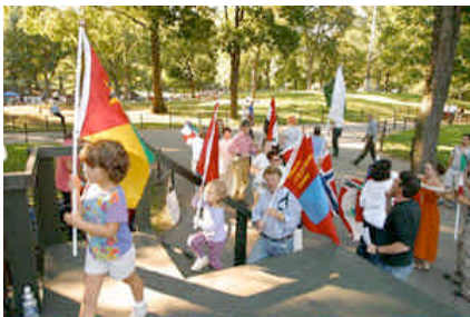
May Peace Prevail on Earth